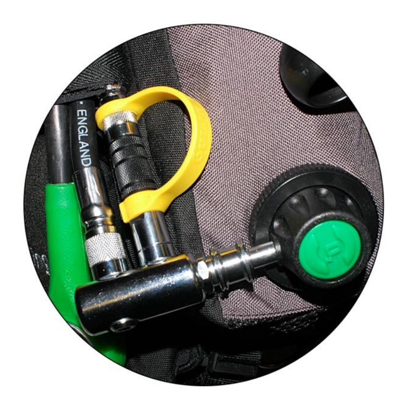
GC3 Shut off valve in the OPEN position

During normal diving conditions, the shut off valve should be in the fully OPEN position to allow the solenoid to function in the normal way. The yellow shut off valve clip MUST be clipped onto the GC3 shut off valve to prevent inadvertent operation to the closed position.