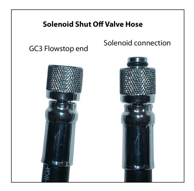
Figure 2. Solenoid Shut Off Valve Hose Connection

IMPORTANT: You must ensure you connect the hose between the Solenoid and the GC3 Flowstop (Shut Off Valve) the correct way round. The hose ends are shown below.