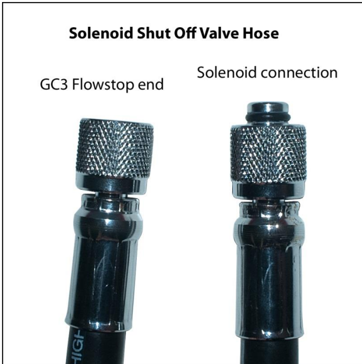
Figure 2. Solenoid Shut Off Valve Hose Connection

IMPORTANT: You must ensure you connect the hose between the Solenoid and the GC3 Flowstop (Shut Off Valve) the correct way round. The hose ends are shown below.